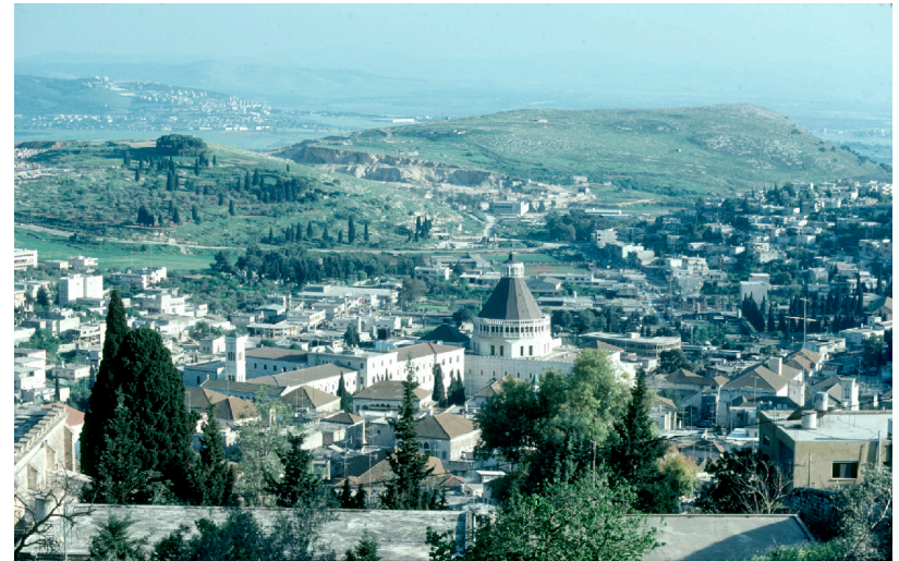
Jesus' hometown, Nazareth, today.

In the space below, write a prayer asking Jesus to give you the courage to know him. Ask him to deal with specific issues in your life which may be paralyzing you with fear and preventing you from responding to him.