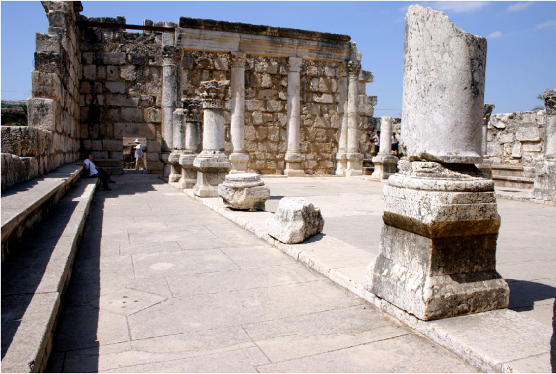
Ruins of the synagogue in Capernaum: this is the very site in which Jesus taught.

6. Who did Jesus call to follow him? What was their response? What did they leave behind? (1.16–20)