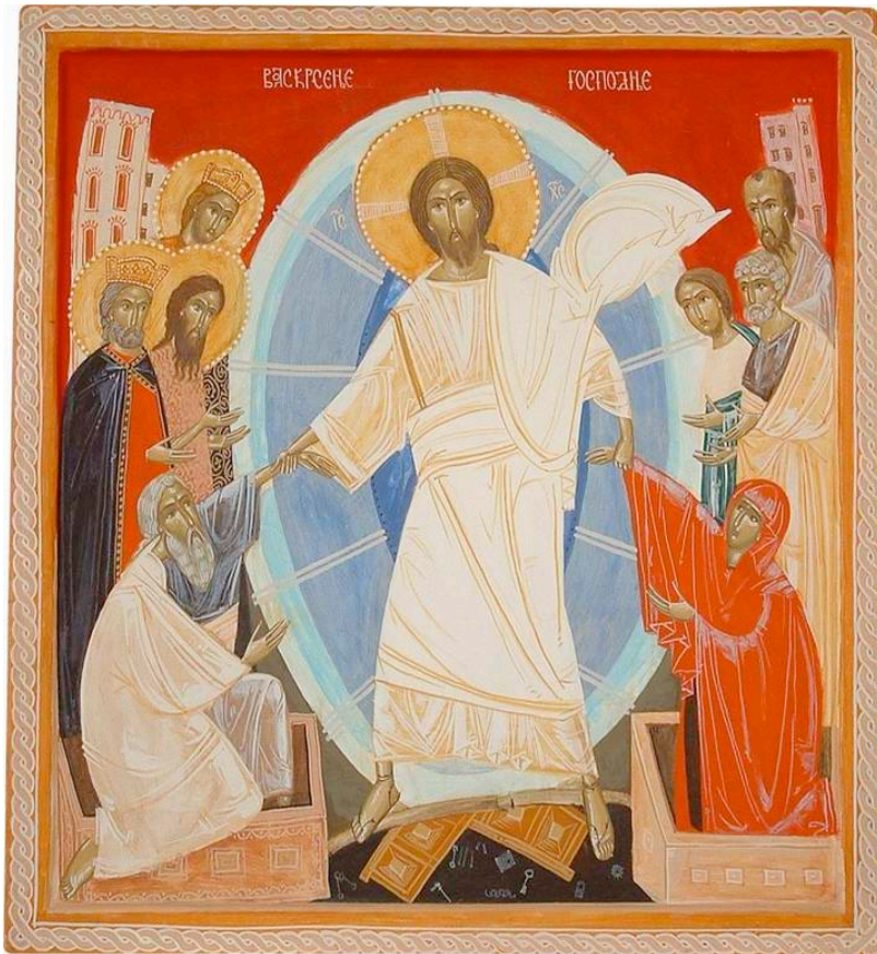
The Resurrection of Christ as painted by Todor Mitrovic.