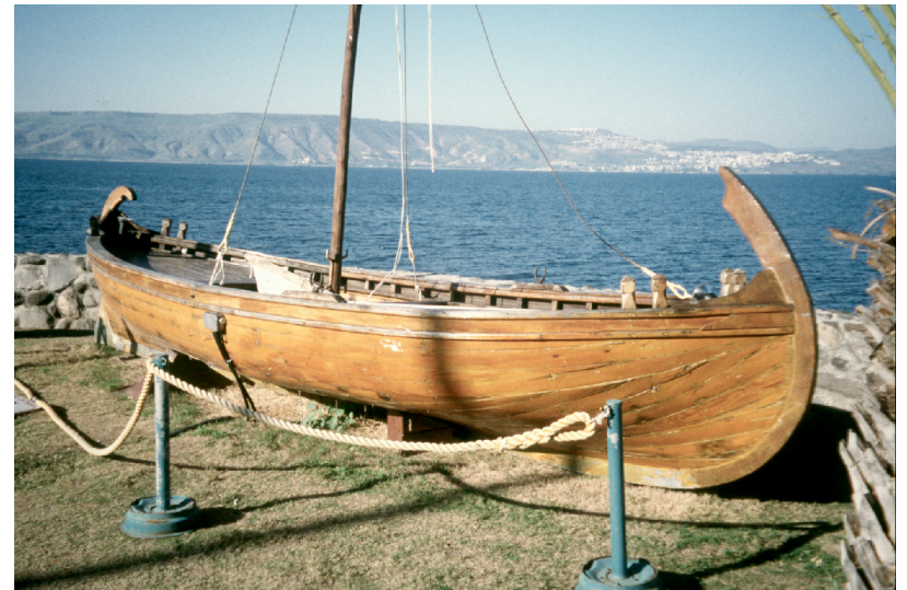
A reconstruction of the kind of boat in use during Jesus' life.

48. What did the disciples fail to understand in 6.52 and 8.21? What things had they witnessed? What do these events suggest to you?