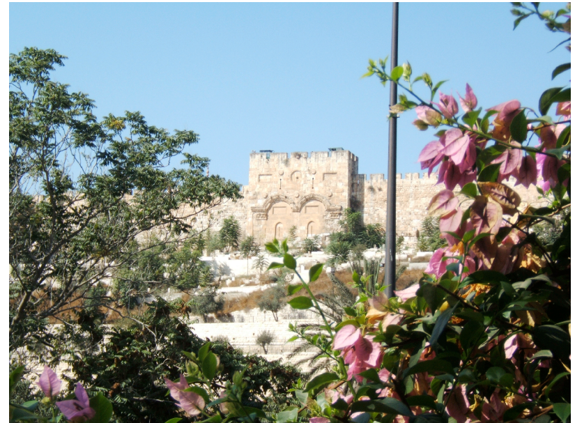
The Eastern Gate of Jerusalem, through which Jesus entered during the week of his death and through which it is anticipated he will enter again. See Ezekiel 44.1–3.

Rejoice greatly, O Daughter of Zion! Shout, Daughter of Jerusalem! See, your king comes to you, righteous and having salvation, gentle and riding on a donkey, on a colt, the foal of a donkey. —Zechariah 9.9 (NIV)